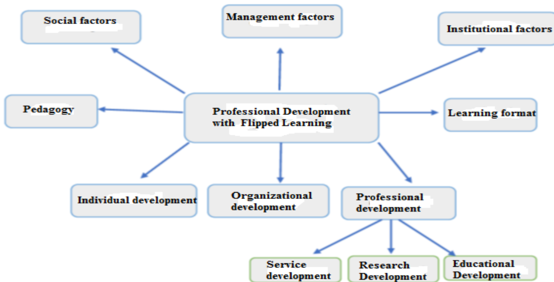
Figure 3. Conceptual model extracted from Meta synthesis

In the fifth stage of meta-composition, each study was carefully examined and analyzed, and using the open coding method proposed by Glaser (1992), the main points of each study were extracted and considered as a concept (code). Then these concepts were grouped in one category according to their commonality according to the researcher. Then, the researcher has placed the identified sub-categories in more abstract categories, at this stage the sub-categories are in 10 categories of institutional factors, management factors, pedagogy, evaluation and quality assurance, learning formats, social factors, personal development, educational development , research development, service development, organizational development (figure 3).