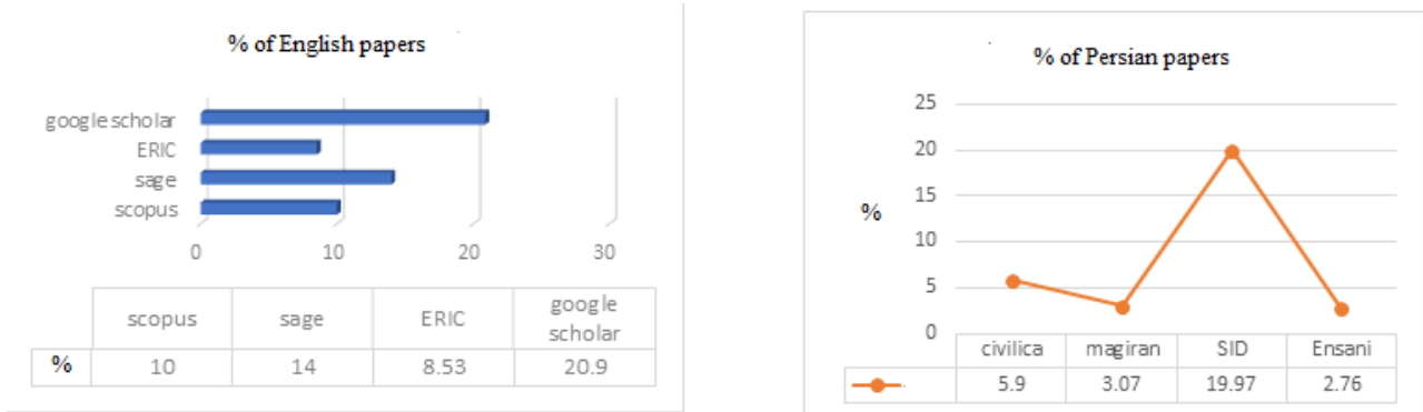
Figure 2. The Final selected English and Persian papers

agreement between the two reviewers was measured using the Kappa test, which was equal to 0.71 indicating a high agreement between the two reviewers. The search for articles continued until saturation was reached and finally 60 articles were selected. Since the data of the present study was extracted from the text of previous studies, the manual coding method was used to analyze the data. Thus, each article was coded separately and then the concepts were categorized in the form of "subcategories" and subcategories were categorized in the form of "main category".