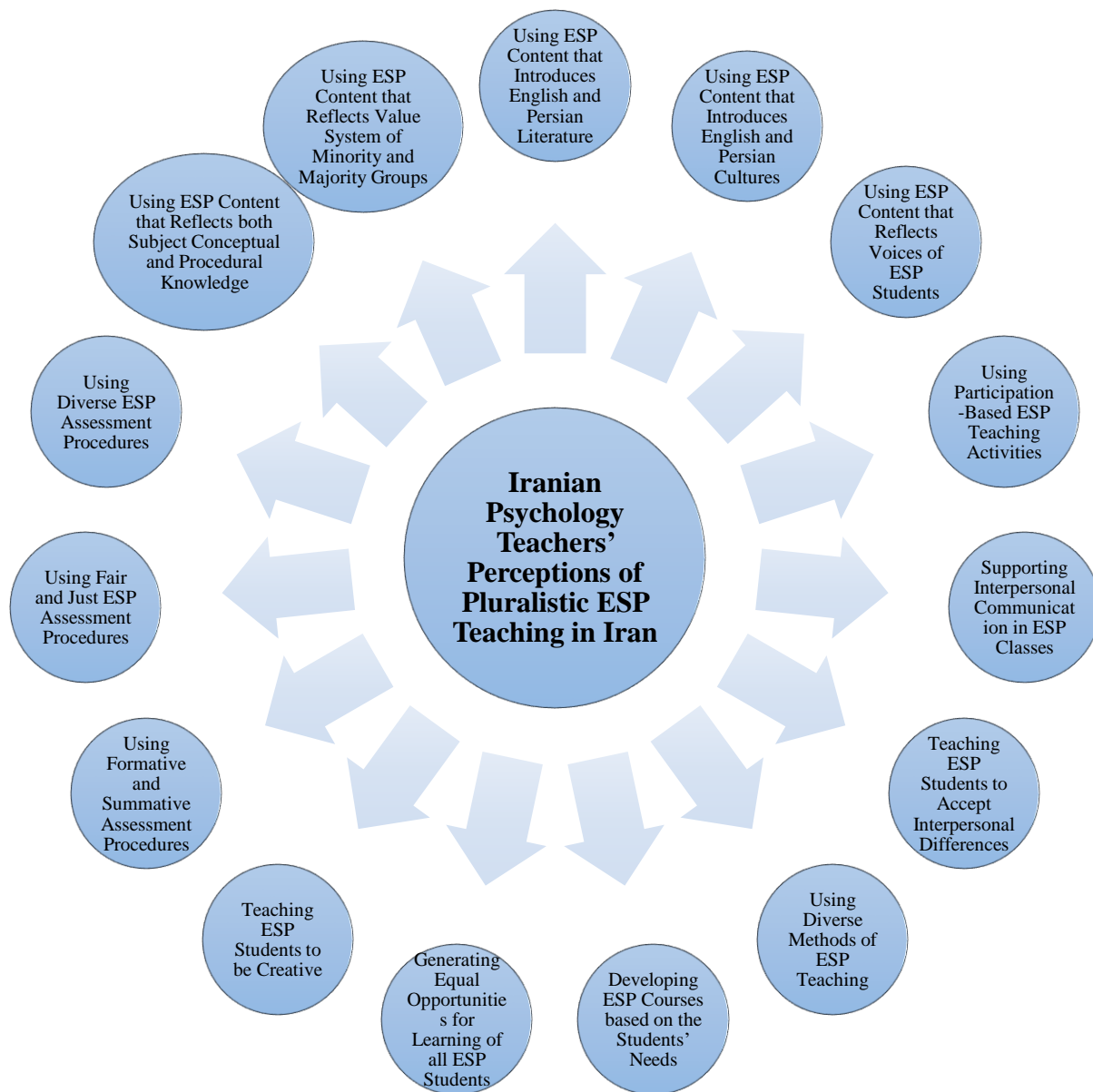
Figure 1. Iranian Psychology Teachers' Perceptions of Pluralistic ESP Teaching in Iran

The extracted themes are thematically shown in Figure 1.